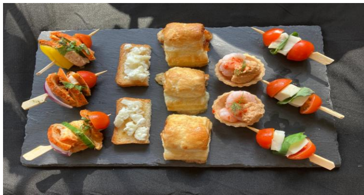
Sweet chilli chicken skewer, Feta & honey toast (V) Pork & leek sausage roll, Prawn & carb pate tart Mozzarella, cherry tomato & basil skewer