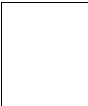
Sicilian lemon tart