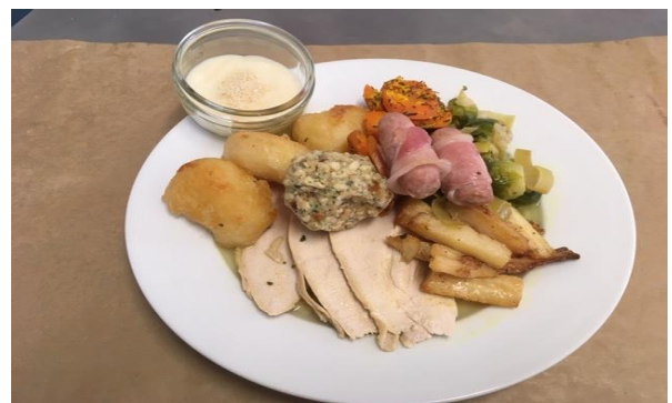
Actual turkey main meal plated