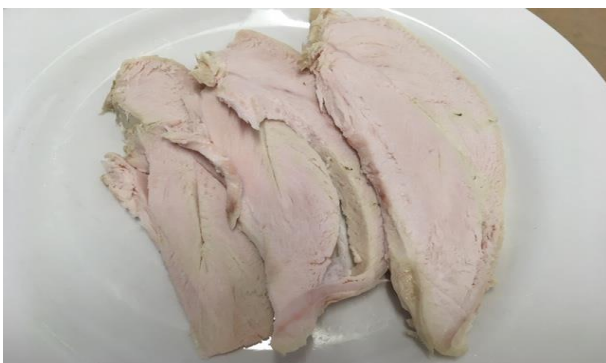
Turkey portion plated