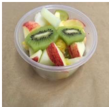
Fresh fruit salad