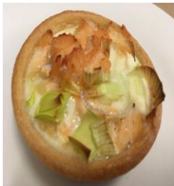
Scottish salmon and leek tartlet