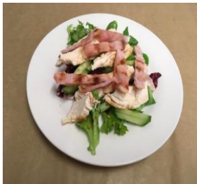
Chicken & bacon salad