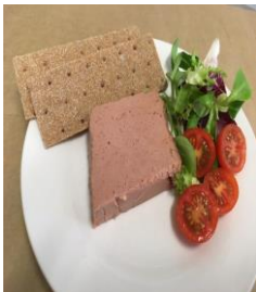
Duck & orange pate